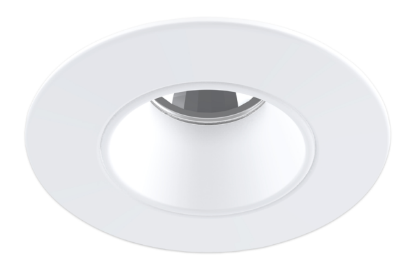
T3450-11-QC (illustrated) (Lamp not included)